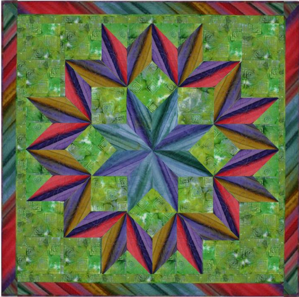
Painter's Palette Broken Star