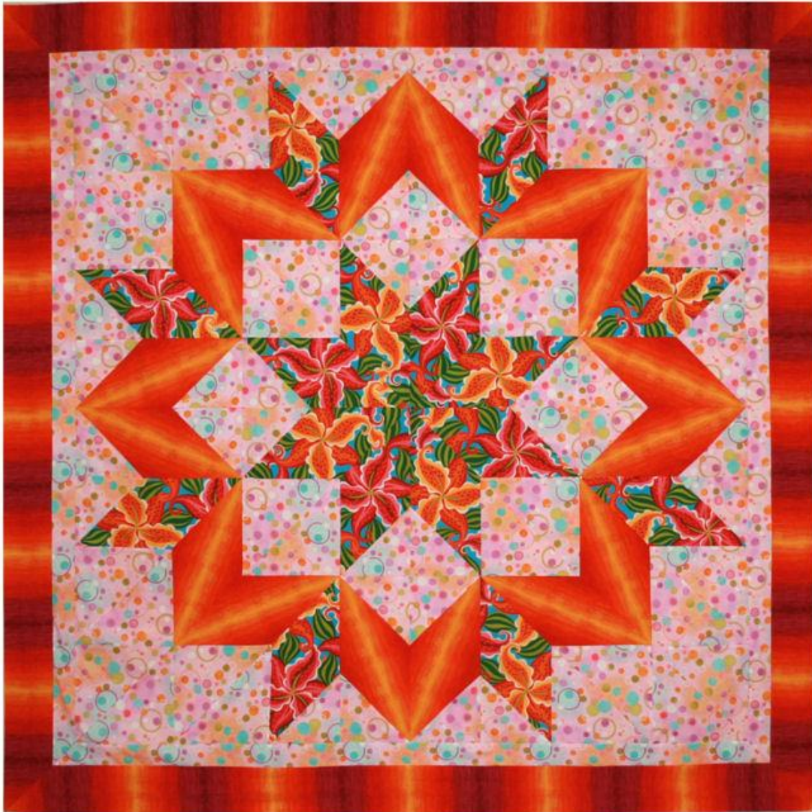
Freckled Lily Broken Star