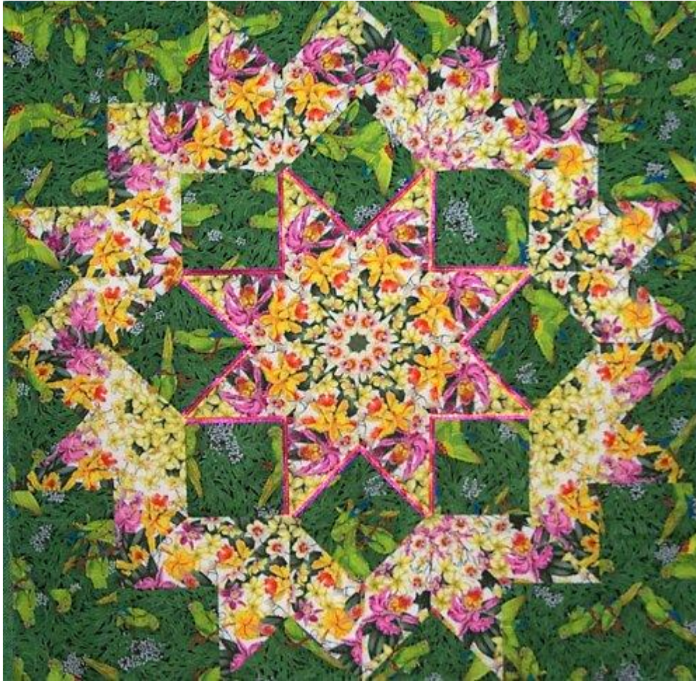
Tropical Fling Broken Star