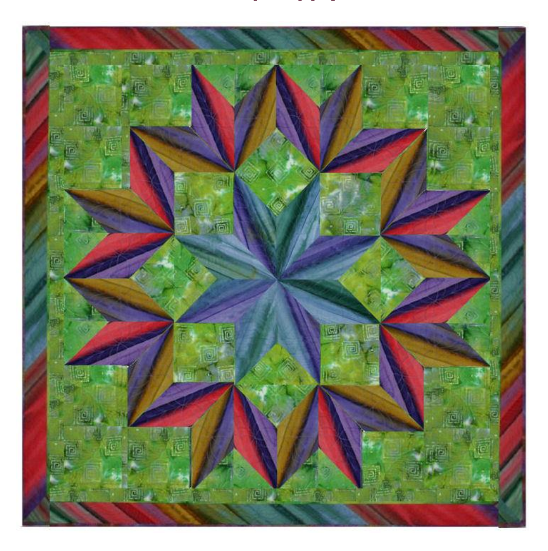
Painter's Palette Broken Star