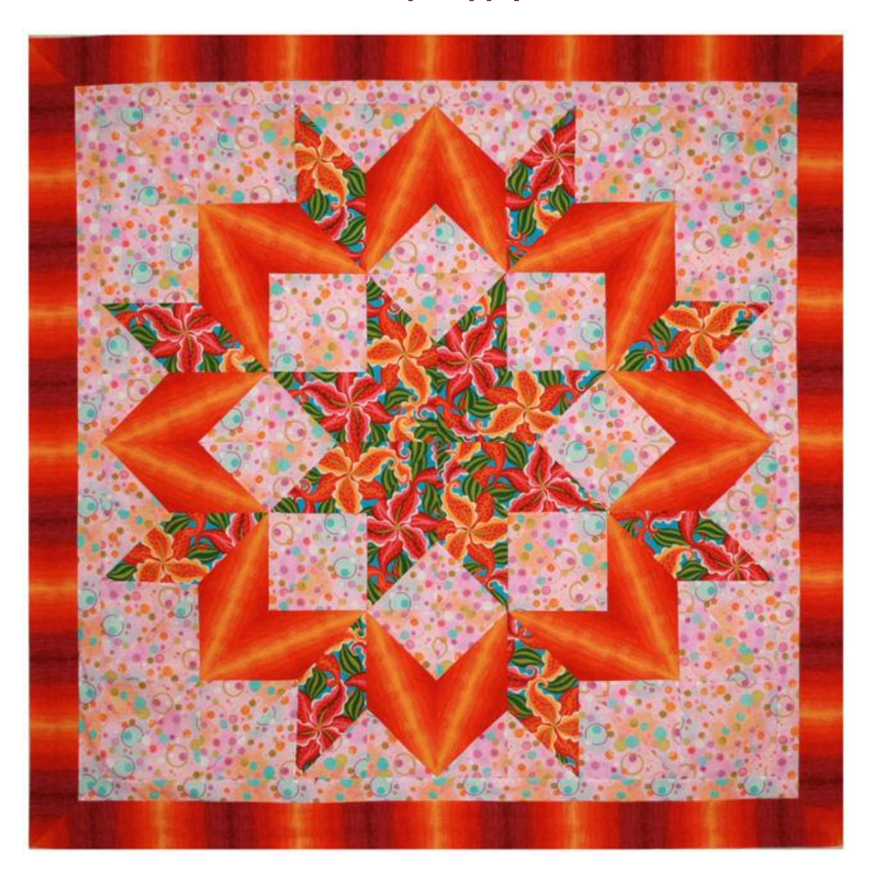
Freckled Lily Broken Star