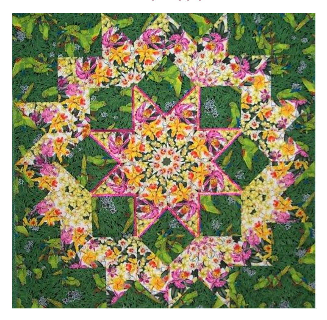
Tropical Fling Broken Star